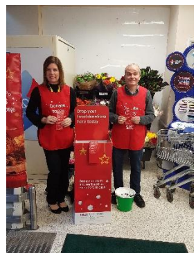
Tesco Byres Road, Dec 2018 with Amey Plc

We are seeking agencies to change from red/orange vouchers to e-referral, please contact us if you are interested.