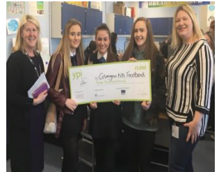
Knightswood Secondary YPI winners 2018

There have been several applications made by schools in the last few years to secure £3000 of funding for our foodbank, however, none had been successful, until this year, when pupils in Knightswood Secondary made a winning case that is resulting in £3000 being awarded to us to buy food+